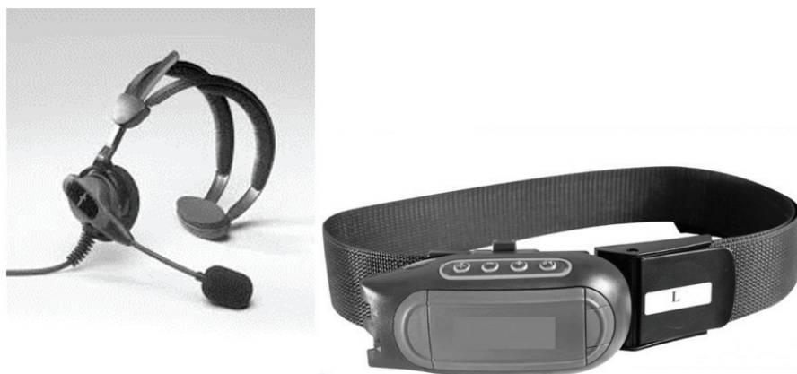
Figure 1. Audio terminal used for warehouse management

The warehouseman has to devote the time and attention interchangeably to the list of goods and the performed task. The repeatability of these activities is particularly dangerous for the warehouseman as it engages the same parts of muscles and joints in a constant and recurring way. The work of the warehouseman supported by voice system differs from the work performed in a traditional way. Voice system allows for releasing warehouseman's hands from the constant verification of number and sort of the picked parcels. The warehouseman is equipped with earphones connected to audio terminal (Figure 1); he is hearing voice commands generated by the system and he is confirming vocally that the task is completed.