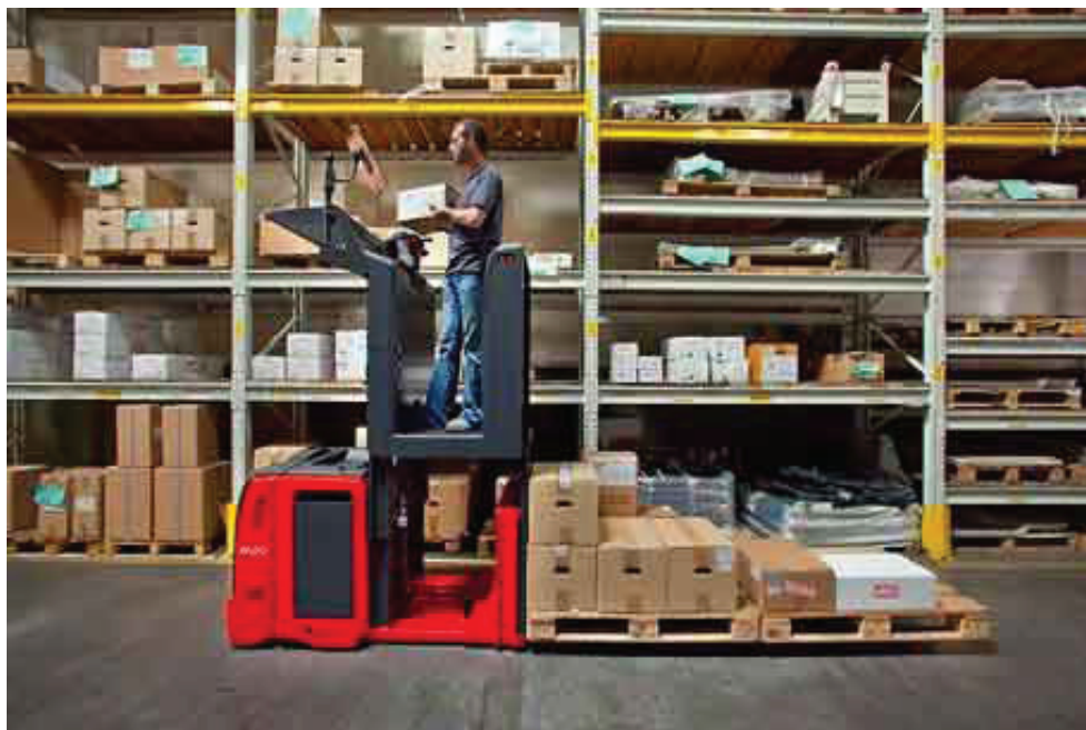
Figure 2. The warehouseman supported by voice system

tion. The messages are pronounced by the warehouseman to the microphone which is connected to the earphone set and then processed by the terminal for system data. This becomes a 'dialogue' between a user and the voice control system. The work of the warehouseman supported by voice system is presented in Figure 2.