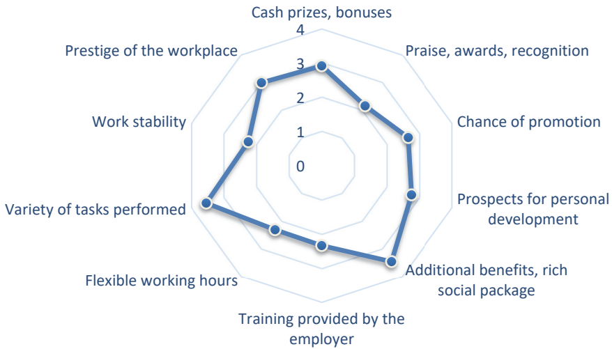
Figure 1. Aggregate result of the average assessment of the motivational potential of work of motivational factors

in the examined company, or the development of a completely new one, which will include activities concerning, among others, anti-harassment policy, and will also specify support in the event of tasks too difficult for employees to perform. In the area of motivators, criteria of praise, awards or other expressions of appreciation by superiors towards employees will be extracted, but also a professional improvement plan and work schedule ensuring the ability to perform tasks will be defined; a clear personnel policy creating a sense of employment stability is not without significance.