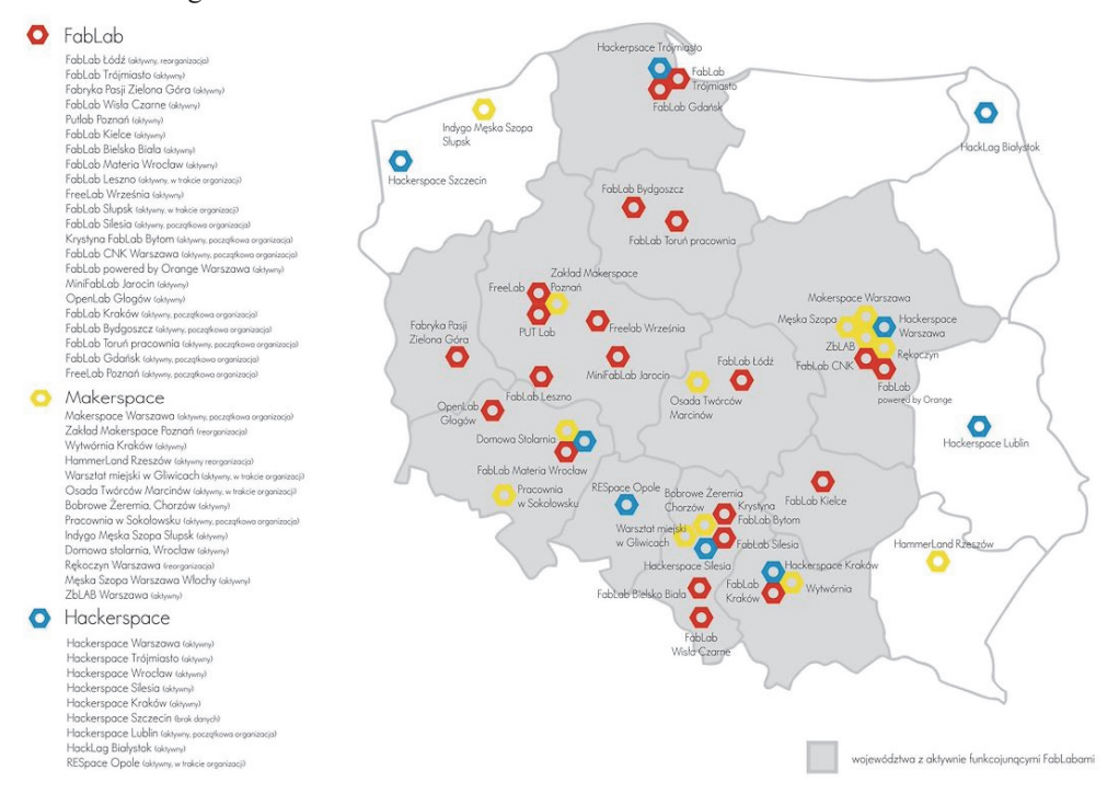
Figure 3. Location of FabLabs, Makerspaces and Hackerspaces in Poland in September 2017

The FabLab market in Poland is under development. Compared to the USA or Germany, FabLabs, Makerspaces and Hackerspaces appeared in Poland relatively late, just a few years ago. The location of FabLabs, Makerspaces and Hackerspaces in Poland at the end of 2017 is shown in Figure 3.